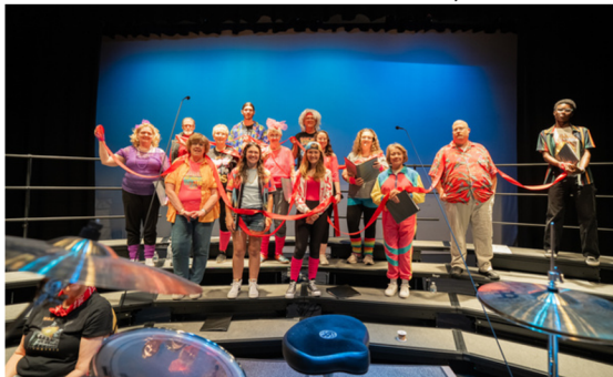
Chanute Area Community Choir — Kansas City, Kansas

A Chorus for a Cause — Canton, Ohio A Notion, A Scream — Portland, Oregon Amor Artis — New York, New York Amy Foundation — Capetown, South Africa Angel City Youth Chorale Concert Choir — Los Angeles, California Angel City Youth Chorale, Grant Elementary — Los Angeles, California Angel City Youth Chorale Kentwood — Los Angeles California Angel City Youth Chorale- Mar Vista Gardens — Los Angeles, California Angel City Youth Chorale Walgrove — Los Angeles, California Appalachian Equality Chorus — Knoxville, Tennessee Arkansas State University Choir — Jonesboro, Arkansas Beau Chant Community Choir — Faribault, Minnesota Bel Air Chancel Choir — Bel Air, Maryland Bella Acapella Portugal — Olhao, Portugal Bella Lumina Choir — Minneapolis, Minnesota Blue Notes — Evansville, Wisconsin Boise Women's Chorus — Boise, Idaho Calliope Women's Chorus — Saint Paul, Minnesota Cantata Academy Chorale — Detroit, Michigan Cantorum Chamber Choir — Orem, Utah Chanute Area Community Choir — Kansas City, Kansas Circle City Chorale — Corona, California Confluence: Willamette Valley LGBT Chorus — Salem, Oregon Coro Con Sonante — Madrid, Spain Desert Voices Chorus — Tucson, Arizona