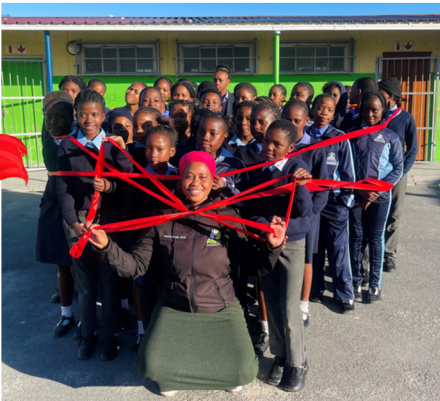
Amy Foundation — Capetown, South Africa