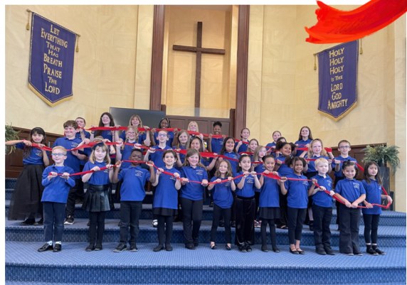
Greater Manassas Children's Choir — Manassas, Virginia