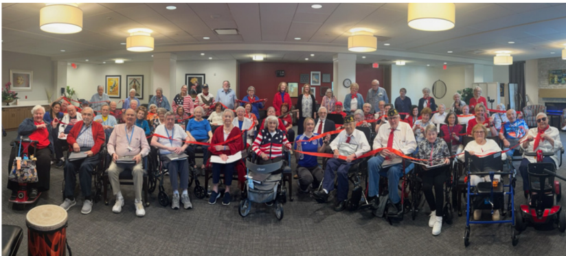
Hotsie Totsie Voices — Lincolnwood, Illinois