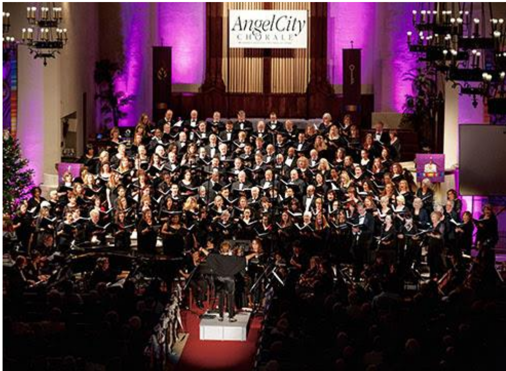
Angle City Chorale – Holiday 2015